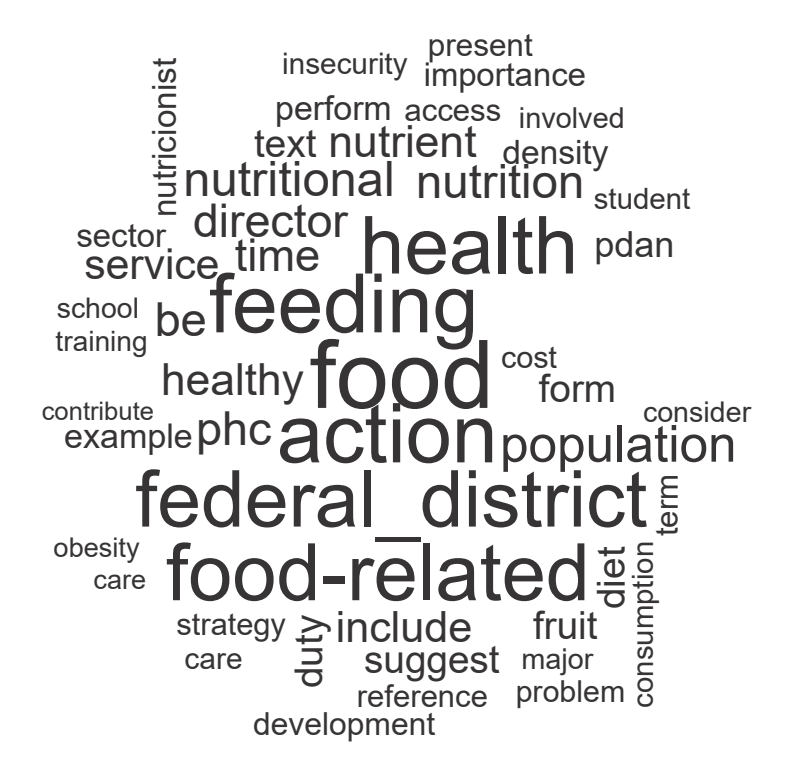
Figure 4. Word cloud obtained from the frequency of content of inputs to the public consultation of the District Food and Nutrition Policy, 2021

Next, the word cloud generated in IRaMuTeQ is observed. Cloud elaboration was grounded on analyzing the frequency of the content resulting from the public consultation of the PDAN ( figure 4 ).