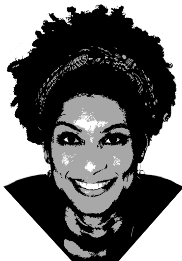
Figure 1. Image of Marielle Franco’s face after digital editing. The final stencil will have four overlapping color layers: black, gray, white and black

In order to achieve the desired stencil effect, the images were edited using computer software ( figure 1 ), assigning them layers of color that simulate natural lighting. The number of layers varied according to the complexity of the images: only one for the simplest, and up to four for the more complex ones, such as human faces ( figure 2 ).